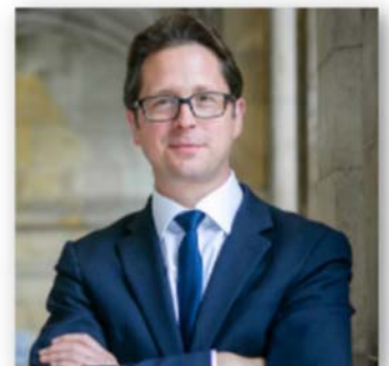
Alex Burghart Parliamentary Under Secretary of State (Minister for Skills)